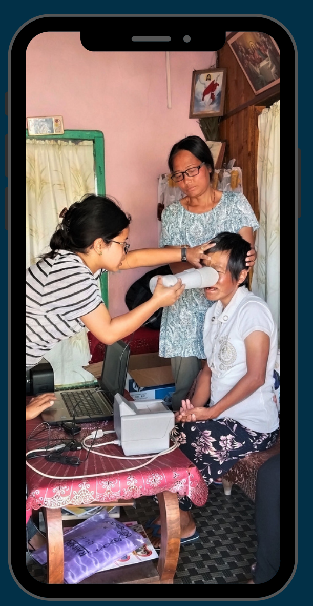
Adhar enrolment at home, three people with disability have received Adhar.